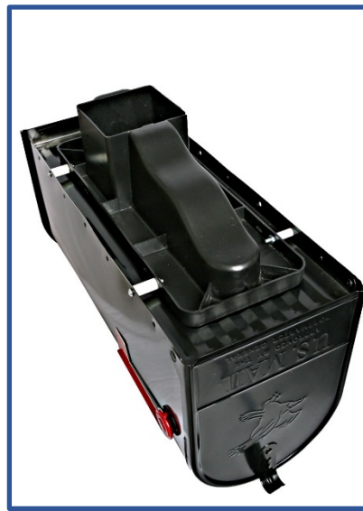
(Fig 3) Image below shows mounting of large mailbox